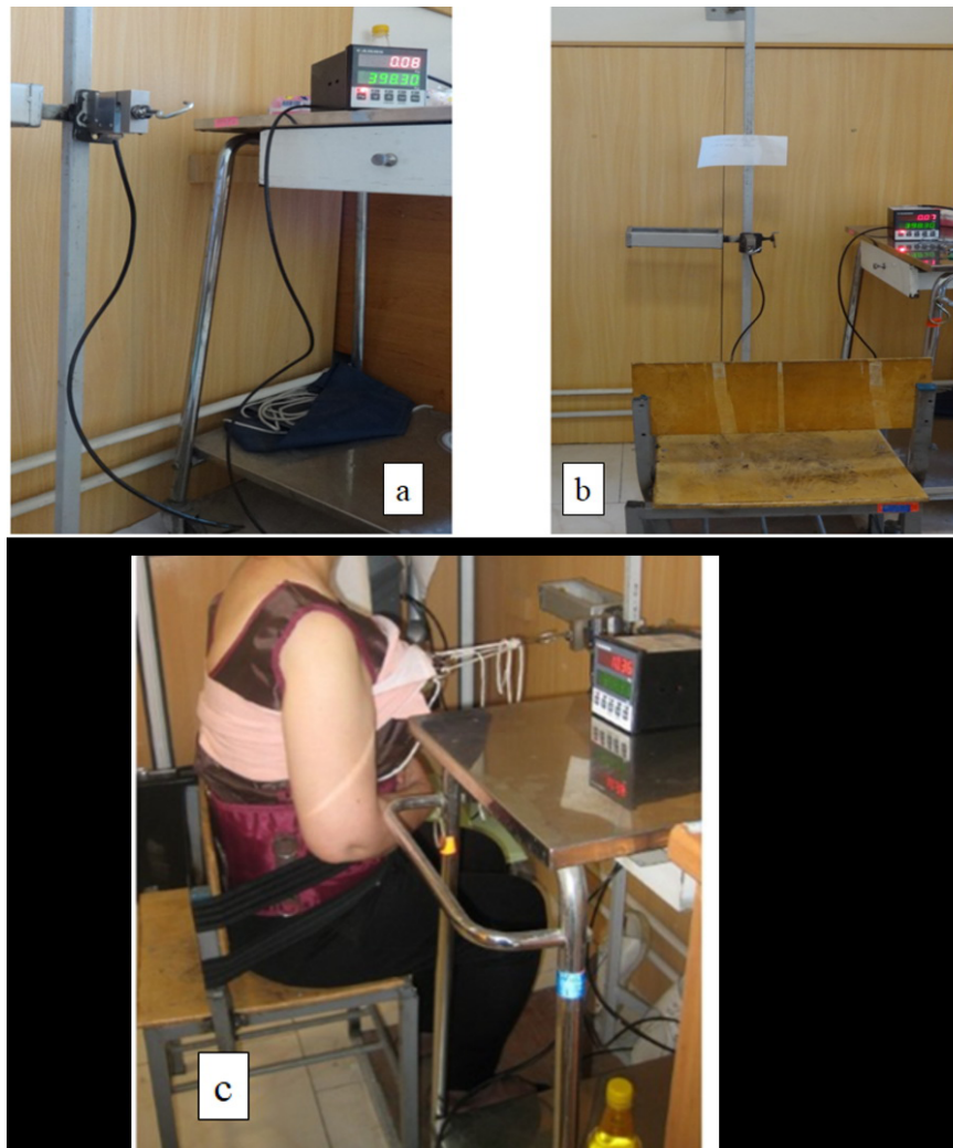
Figure 2. Pulling apparatus set-up

a: An „S“ shape load cell attached on vertical bar for isometric force and endurance measurements; b: An apparatus to assess maximum static extensor force in sitting; c: The load cell aligning with the midline, superior border of manubrium and subject pulling trunk maximally.