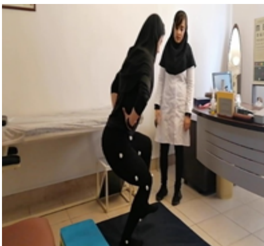
Figure 3. How to land a single leg squat

Finally, the motion was recorded by the Casio's high-speed camera (HZ300), and the angle of the pelvis and the knee varus were recorded in this movement by the software of angle measurement.