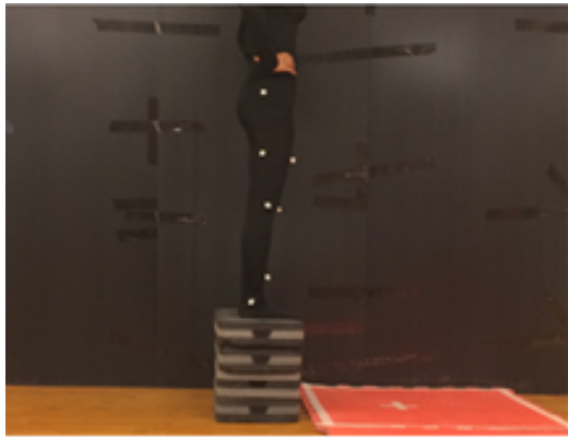
Figure 1. Landmarks from the side view