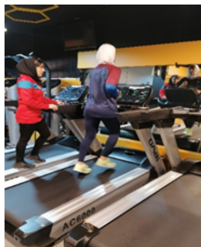
Figure 4. Electromyography of wave Quest M16P model, 16 channels