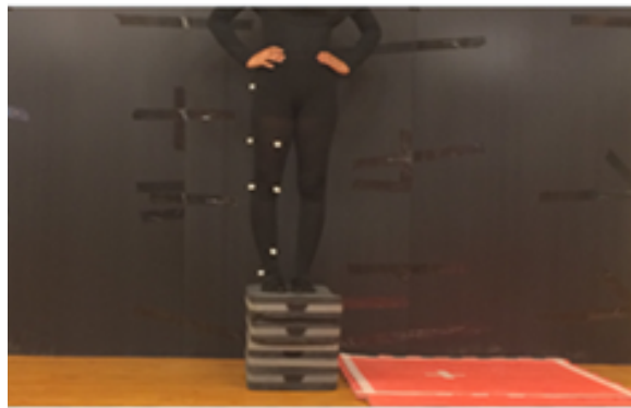
Figure 2. Landmark from the front view