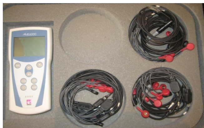
Figure 1. Electromyography recording device (ME6000model, Mega electronic Ltd)

A total of 30 healthy females (Mean±SD=height: 164±6.4 cm, weight: 58.4±4.1 kg, age: 23.6±3.4 years) volunteered to participate in the present study. The subjects would be excluded from the study if they had any history of trauma or surgery or deformity in the lower extremity or any neurological disease. They had a normal range of motion and good muscle strength in the knee joint and they did not do any professional sports. The study was approved by the Iran University of Medical Sciences (IUMS).