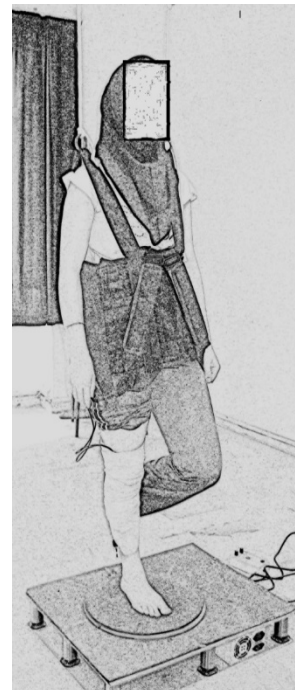
JMR Figure 2. The rotational perturbation device and subject's position

First, the subject was perturbed with her knee in a straight position, and then in a bending position (Figure 2). Each subject was tested for four conditions and the order of conditions was randomized. The central nervous system prepares postural responses differently in anticipated compared to non-anticipated perturbations [18]. In this study, the subject did not know the exact time of perturbation. The rotational perturbation platform is made of a circular platform that has an engine embedded underneath.