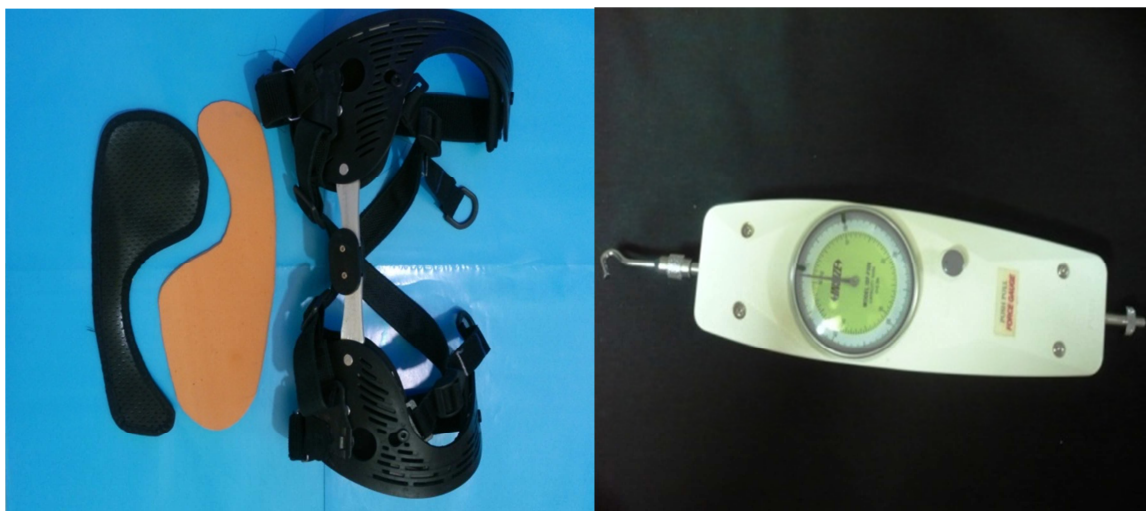
Figure 1. The pictures relevant to the dynamometer and the pads inside the shells of orthosis

the upper edge of the upper shell of orthosis, together with the lower edge of the lower shell and ankle of the participants, were remarked and eventually, participants were asked to walk for 10 minutes on a flat surface and also walking up and down the stairs. The pulling force of the straps was measured by the dynamometer of model ISF-F500 and each participant was filmed at the beginning and end of each 10 minutes. Finally, the distal migration of the orthosis on the knee was measured by the Kinovea 0.8.15 software (Copyright © 2006-2011- Joan Charmant & Contrib. Kinovea is subject to the terms of the Gnu General Public License version 2). The Kinovea software can view the videos according to the angle and distance analysis of the markers. This application is highly reliable and valid, according to studies conducted by Balsalobre-Fernandez et al. in 2014 (23) and Ogueta-Alday in 2013 (24). At the end of the test, the comfort of the knee orthosis was easily evaluated in four modes, including orthosis with PE pads, orthotics with PE pads with weights, orthosis with silicone pads, and silicone pad orthosis with weight, using a visual analog scale.