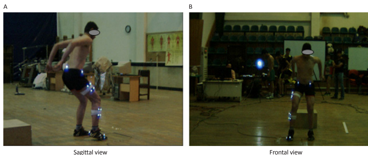
Figure 3. Marker set during jump-landing maneuver

The z-axis (internal and external rotation) passed through each segment's proximal and distal endpoints. They oriented the y-axis (abduction and adduction) orthogonal to both the x-axis and z-axis. For each trial, knee frontal and transverse plane angles were obtained at the time of peak and average