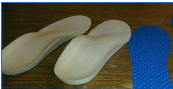
Figure 1. Textured insole (right) and common insole (left) used in this study

As the normal distribution of data was confirmed by Shapiro-Wilk test, the parametric repeated measures ANOVA was conducted. Then, the least significant difference (LSD) was used to determine the difference between tests. The P value less than 0.05 was considered statistically significant. The average value of the measured indices and the results of post hoc test are present-